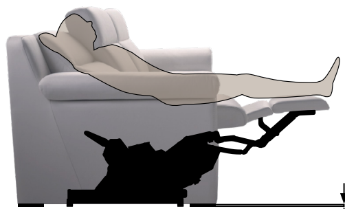
Low Foot (Padded closed base)